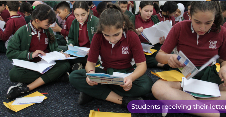
Students receiving their letters from their Career Mentors