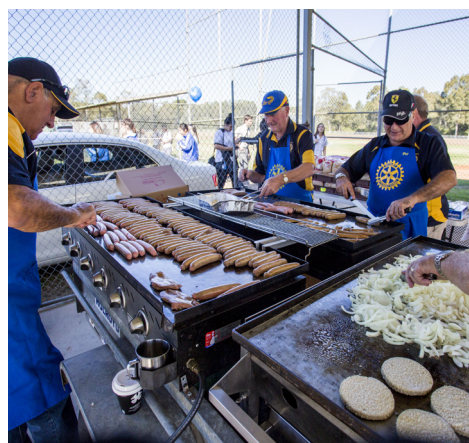
Thank you Cucina 105 Restaurant and Rotary Club of Holroyd for catering for the lunch during Seek a Skill.