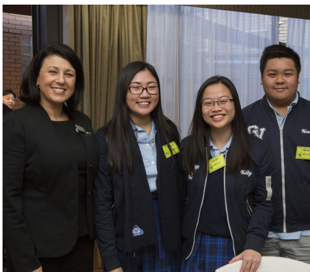
Far Left: FUSION Partners, SummitCare Canley Vale representatives, Canley Vale High School and Club representatives from St John's Bowling Club and Fairfield RSL respectively.